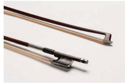
BA40 Material: Brazilwood