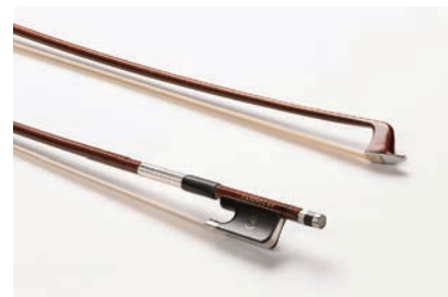
BC304 Material: Pernambuco faced Carbon fiber