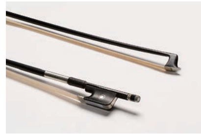
BA301 Material: Carbon fiber