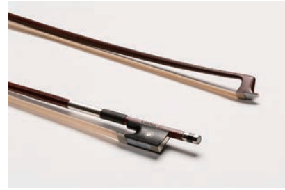
BL40 Material: Brazilwood