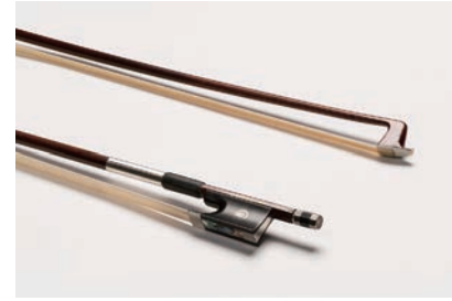
BL304 Material: Pernambuco faced Carbon fiber