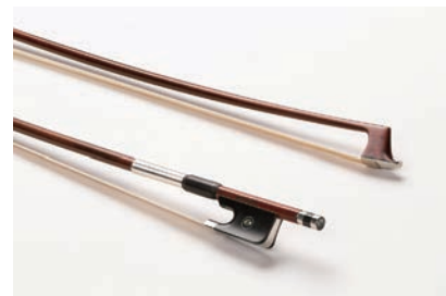
BC80 Material: Pernambuco