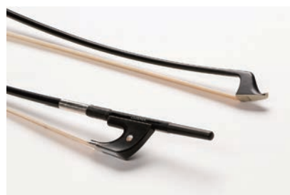
BBG301 Material: Carbon fiber